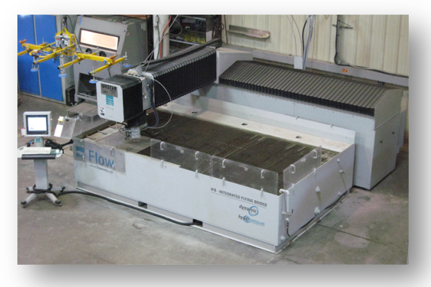
WATER JET CUTTER