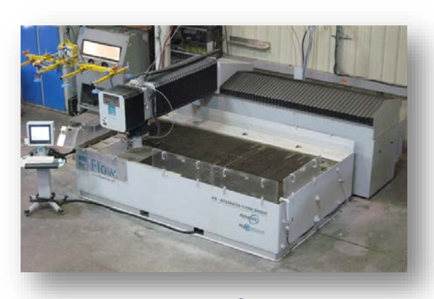
WATER JET CUTTER