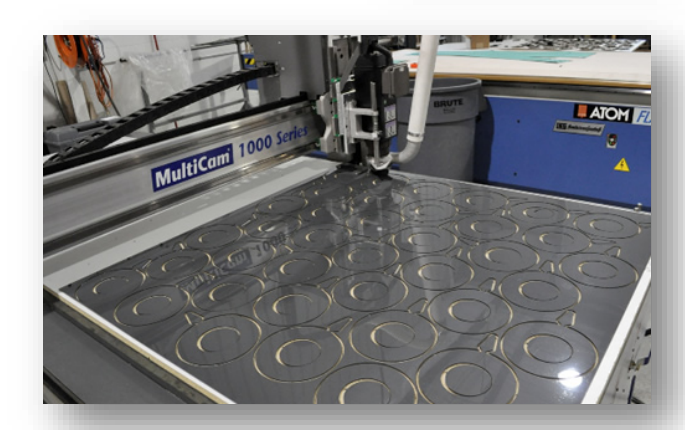
OSCILLATING KNIFE CNC CUTTER "FLASHCUT"