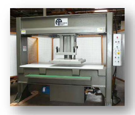
TRAVELING HEAD PRESS