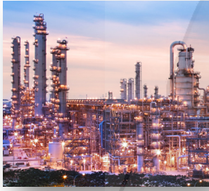
OIL / GAS